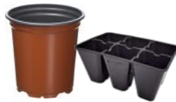
Plastic plant pots and trays (no soil)