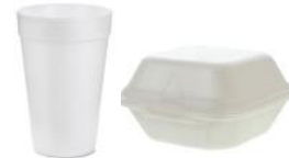
Styrofoam (food and drink only)