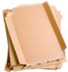
Corrugated cardboard (flatten)