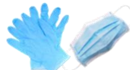
Disposable gloves, masks, sanitizing wipes