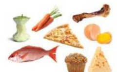
Food waste (consider composting fruits and vegetables)