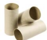
Toilet paper rolls, Paper towel rolls