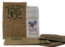
Brown paper bags