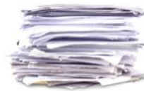
Paper (office, mixed, writing)