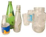
Glass bottles and jars