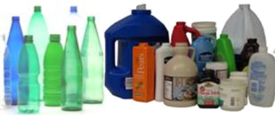
Plastic bottles, tubs, containers (caps can be left on)

Rinse all containers and ensure they are clean of liquids or food