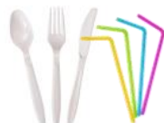
Plastic straws, plastic cutlery