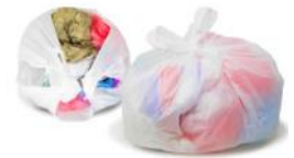
Plastic bags (clean, dry, empty)