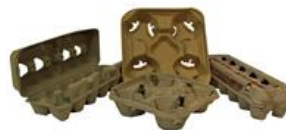
Paper egg cartons, paper take-out trays