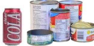
Metal beverage cans, metal food cans