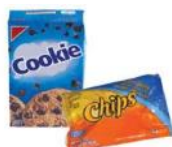
Cookie, chip, snack bags and wrappers