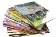
Magazines & Catalogues