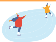
Photo sent to recreation@dysartetal.ca on _____ (date)