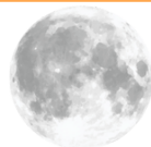
Photo sent to recreation@dysartetal.ca on _____ (date)