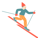
Photo sent to recreation@dysartetal.ca on _____ (date)