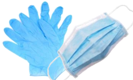
Disposable gloves, masks, sanitizing wipes