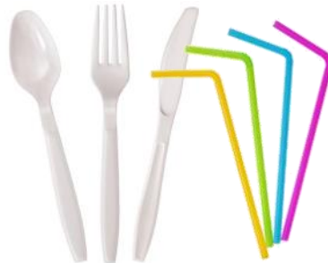
Plastic cutlery, plastic straws