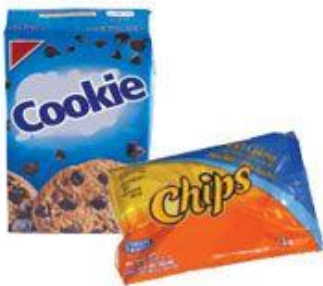
Cookie, chip, snack bags and wrappers