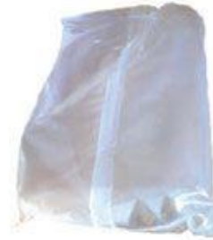
Plastic liner bags