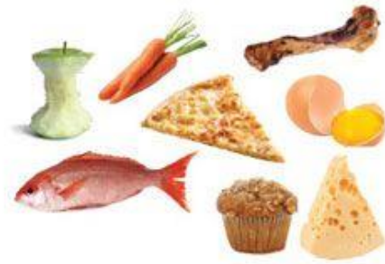
Food waste (consider composting)