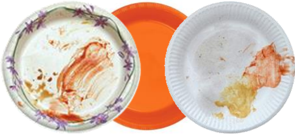
Dirty paper, plastic, Styrofoam plates