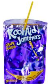
Beverage & food pouches