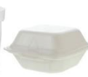
Styrofoam (food and drink only)