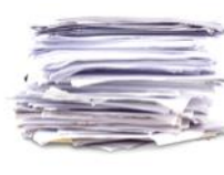
Paper (office, mixed, writing)