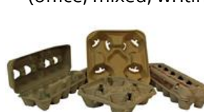
Paper egg cartons, paper take-out trays