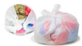
Plastic shopping bags (clean, dry, empty)