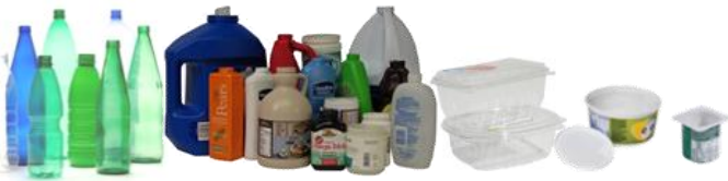
Plastic bottles, tubs, containers (caps can be left on)

Rinse all containers and ensure they are clean of liquids or food