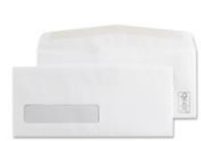
Envelopes (includes ones with windows)