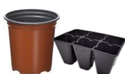
Plastic plant pots and trays (no soil)