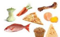
Food waste (consider composting fruits and vegetables)