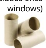
Toilet paper rolls, Paper towel rolls