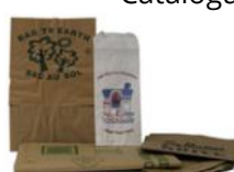
Brown paper bags