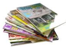
Magazines & Catalogues